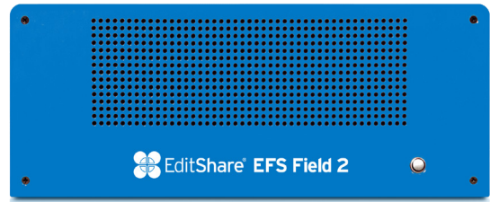
XStream EFS Field 2 Expansion